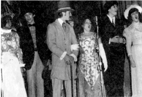
OPERETTA LEADS SING OUT a selection of medlies before a sell-out crowd in their last performance of "Hello Dolly," December 6, in the aud.