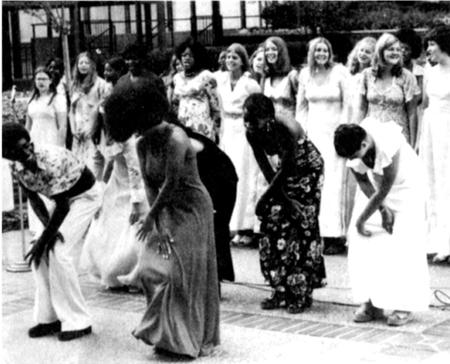
UPTOWN, A PROGRAM in summer employment for students, swings out the charleston in their version of "Ain't She Sweet."