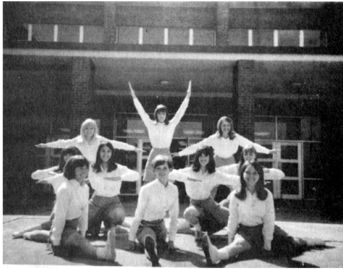
FROM A GROUP OF 30, these girls were selected by the students to serve SW as the 1969-1970 cheerleaders.