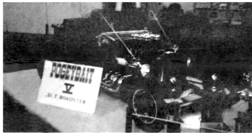
POGEY BAIT V. A 1923 ROADSTER, is displayed at the Arena. This car has won numerous awards in shows across the country.

The GAA Coke and Cake sale was held on Tuesday, October 29, in the cafeteria, during sixth period and after school. The girls cleared $110 from the sale. The money will be used to buy GAA pins, letters and trophies.