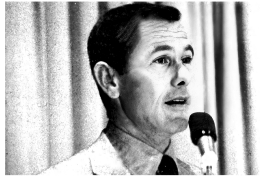
Comedian, Johnny Carson, answers questions for Prom Magazine reporters, at an interview held at the Chase-Park Plaza Hotel.