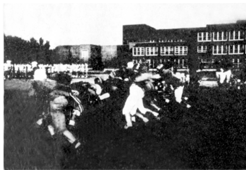
SOUTHWEST LONGHORNS seen scrimmaging early in the season on their field behind school.

This year, the harriers have added a new attraction. A box turtle named Old Belle, is the team's mascot.