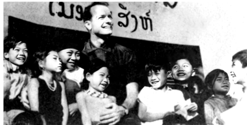
Dr. Dooley, from St. Louis, poses with happy Laotian urchins.

For the past several months Dr. Dooley has been in America on a speaking tour to raise funds to establish more hospitals in Laos. And more and more will be repeating the words of a small Laotian boy cured of a near-fatal illness: "Kenoi mak Thanh Mo li. (I like Americans.)"